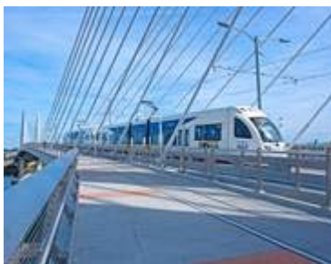
A light rail train crossing the completed Tilikum Crossing.