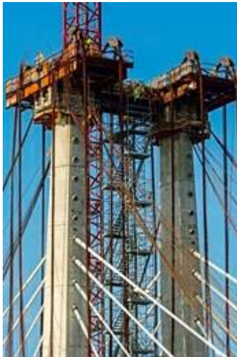
Permanent cable strands are fed into saddles located on the tower's pylons. Protective white-sheathing is then added to protect the permanent cables.

SW WA Public Agency Liaison Committee meeting – January 28