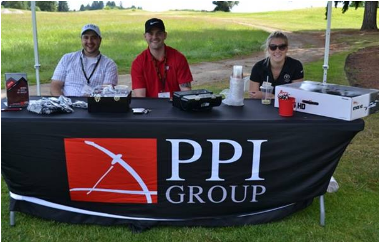
ABOVE: PPI Group

Golfers were happy to come upon the PPI Group's tee.